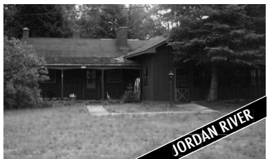
2452 MARTINSON DRIVE., EAST JORDAN