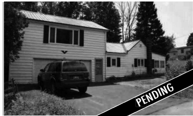
401 ERIE STREET, EAST JORDAN

Petoskey schools! Quiet country setting but close to the conveniences of town! Needs some TLC and finishing touches. MLS 437454. Ask for Mike Stark $29,900