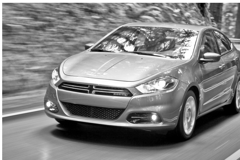
The 2014 Dodge Dart (shown here), Dodge Avenger and Chrysler 200 sedans have achieved Top Safety Pick ratings from the Insurance Institute of Highway Safety (IIHS).

The acclaimed compact was engineered with a class-leading total of more than 60 safety and security features. In addition to its solid structure and 10 standard air bags, the Dart features an available ParkView back-up camera, Blind-Spot Monitoring and Rear Cross Path detection, which alerts drivers to traffic that approaches the vehicle's