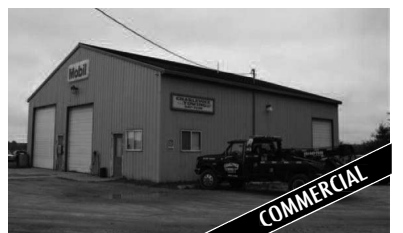
10950 N US 31, ELLSWORTH