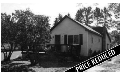
405 UNION STREET, EAST JORDAN