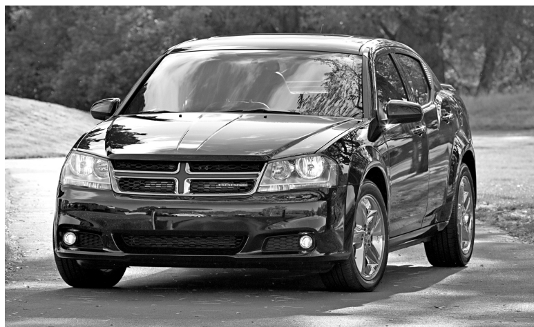
Safety features on the Avenger (shown here) and 200 sedans are standard equipment, including supplemental side-curtain airbags for front and rear outboard occupants.