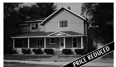
308 MAPLE • EAST JORDAN

What an amazing backyard, a fire pit with hand carved logs to sit on for entertaining, great landscaping and a deck too. MLS 438606. Ask for Holly Nierman. $74,900