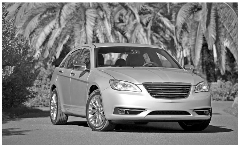
The Chrysler 200 sedan (shown here) also received the IIHS Top Safety Pick rating.

rear from a 90-degree angle. All available safety features on the Avenger and 200 sedans are standard equipment, includ-