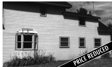
5018 RIVER RD, PETOSKEY

Petoskey schools! Quiet country setting but close to the conveniences of town! Needs some TLC and finishing touches. MLS 437454. Ask for Mike Stark $29,900