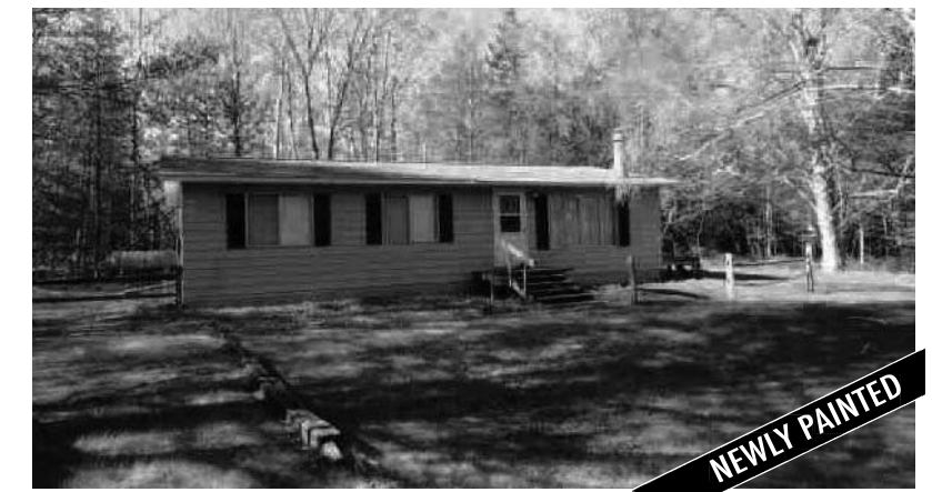
03653 COMMODORE DRIVE, EAST JORDAN • $106,900

Exceptional home in town with a double lot for that future carriage house or pole barn. his quiet street is within walking distance of parks and restaurants.. MLS 438904. Ask for Mike Stark. $106,900