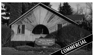
306 MAIN STREET EAST JORDAN

11.60 Acres on US 31 with 2 Buildings 1) 48x50 2) 24x36. 1999 16x80 mobile home over looking large pond/. MLS 435822. Ask for Holly Nierman. $114,000