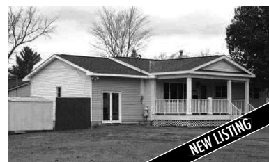
404 TRENT STREET, BOYNE CITY

3BR, 1.5BA on 27 wooded and rolling acres. Here's your chance to put your personal touches on a home with acreage. MLS 437970. Ask for Holly Nierman. $49,999