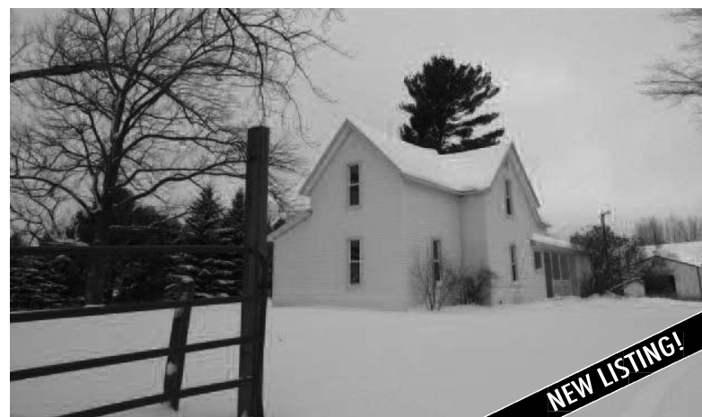
14197 VEENSTRA ROAD, CHARLEVOIX • $129,900

Horseman's dream on 10 acres!!! HUGE indoor riding arena, stables and yet close to schools and the City of Charlevoix. Needs a little TLC! With your finishing touches this could be your dream home. MLS 439110. Ask for Mike Stark.